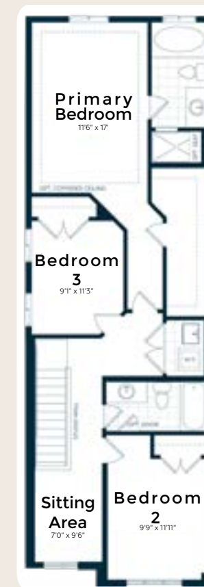
Upper Floor ▲