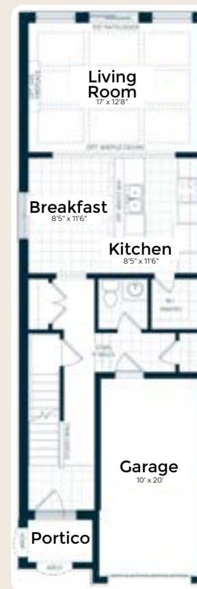
Main Floor ▲