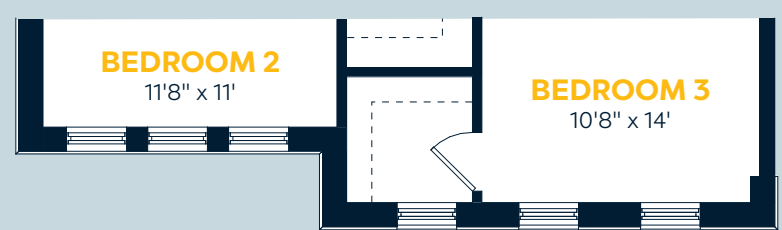
Elevation B Front Windows Variation